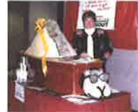
Conference participants and presenter in Yakima, WA