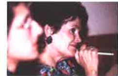
Listening to speakers

License Here's Looking At You, 2000 ® and other prevention programs to AGC Educational Media to market and sell