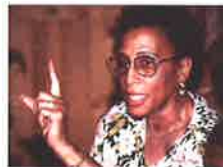
Participating in workshops

C.H.E.F.'s first Organizational Health Education Recognition Award is given to Healthy Mothers, Healthy Babies ™