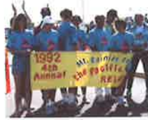
The running team at the end of the race