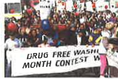
Rally held in Seattle, WA

Support of a public education campaign, "Meeting the Need for Today's Health," in partnership with KIRO Television & Newsradio and Pacific Medical Center