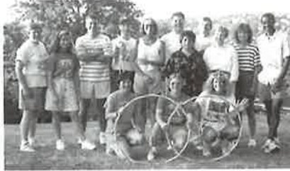
Teams from the two middle schools

Partnership with the National Middle School Association and the American Association of Health Education to publish a special issue of Journal of Health Education on young adolescents